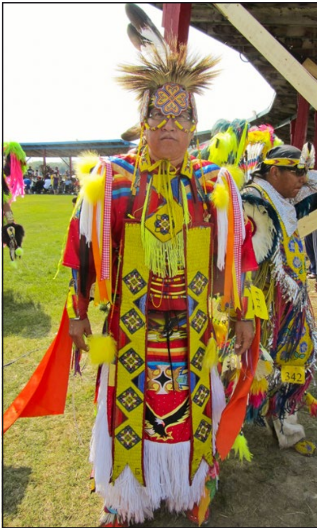
Roots. Indigenous people in North America are looking for their roots.

especially true about the people of the western world, where ideologies like these have flourished over the last centuries.