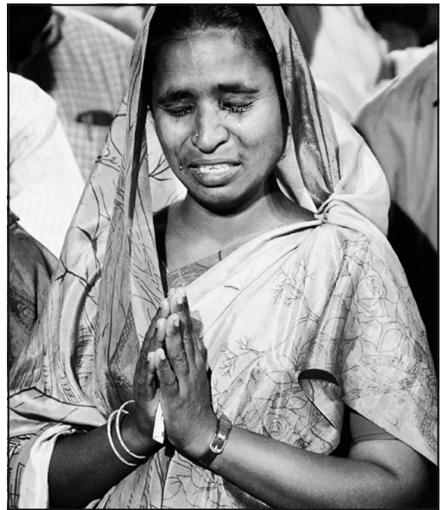
Saved: A woman in India received Jesus in the city of Nidadavolu, India.