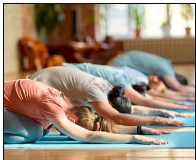
Yoga. Many are practicing yoga. A religious practice?